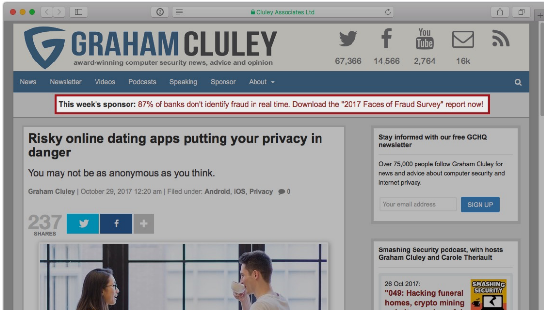
Example of sponsorship promotion on main website

The sponsorship promotion is displayed as a text-based link on every single page of the website, including the main page, for the entire week – linking to the sponsor's website or specific promotion.